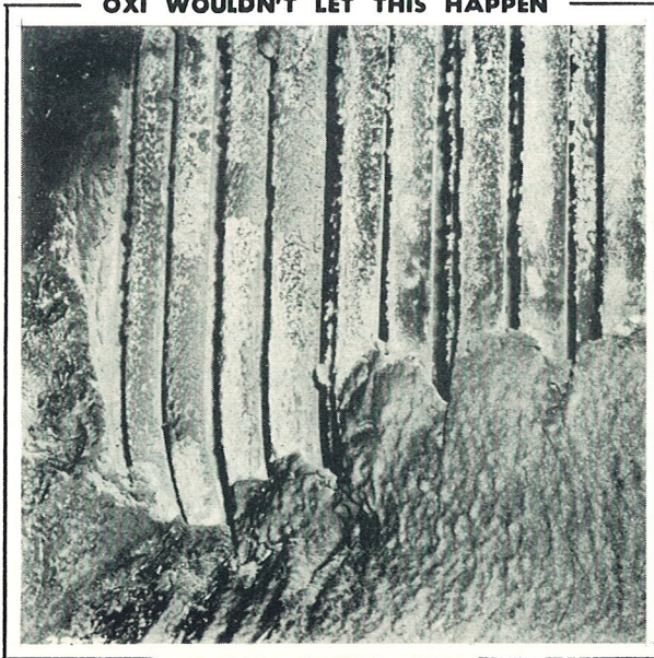
BEFORE USING OXI